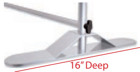
Sturdy Steel "Bridge" Support Base.