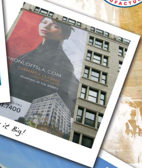
Say it Big!