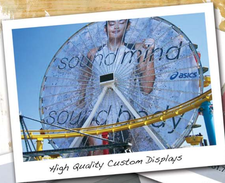
High Quality Custom Displays