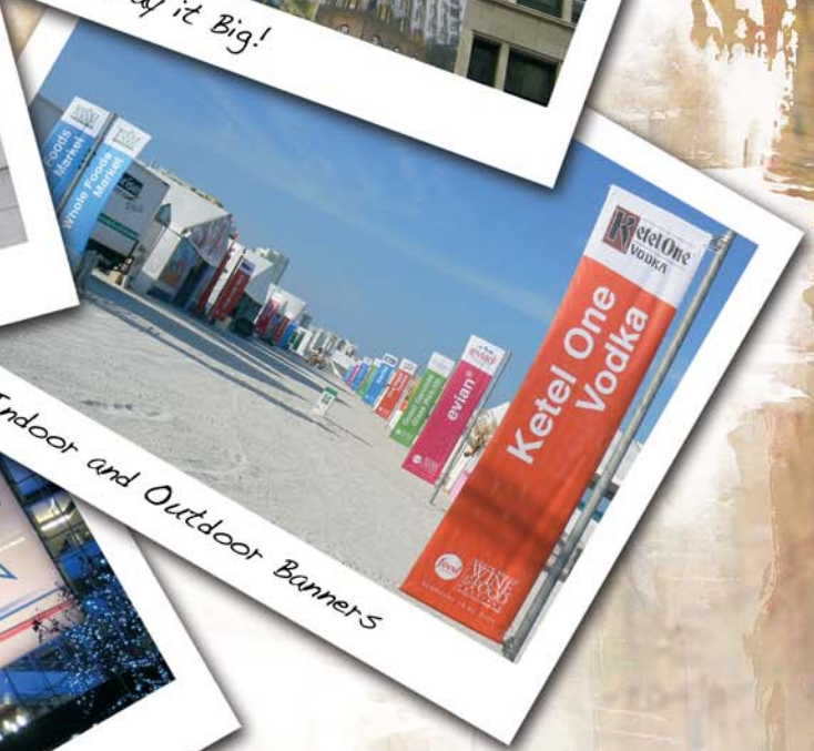
Indoor and Outdoor Banners