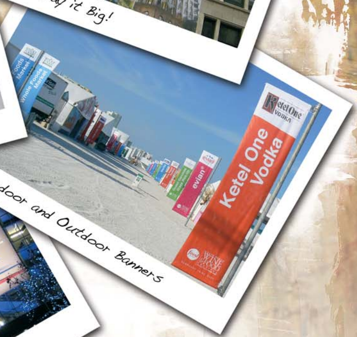
Indoor and Outdoor Banners