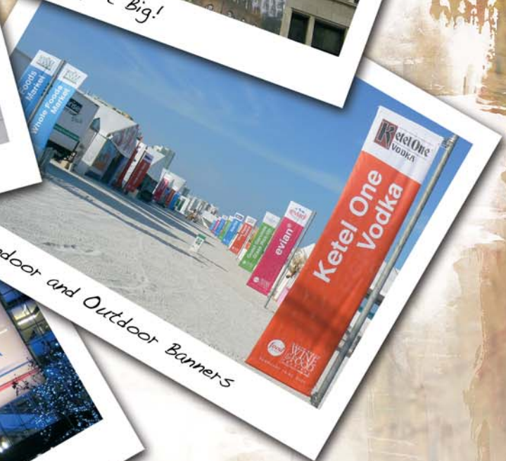
Indoor and Outdoor Banners