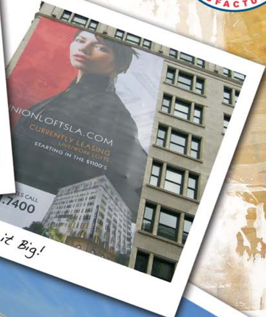
Say it Big!