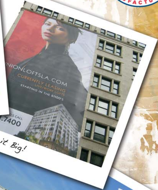
Say it Big!