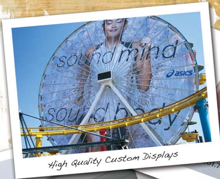
High Quality Custom Displays