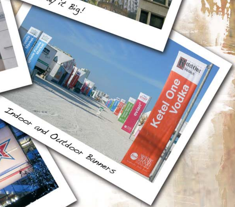
Indoor and Outdoor Banners