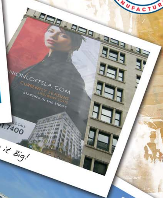
Say it Big!