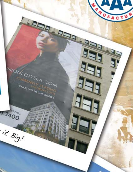
Say it Big!