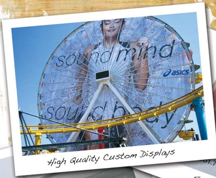
High Quality Custom Displays