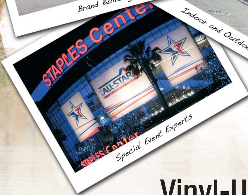
Special Event Experts