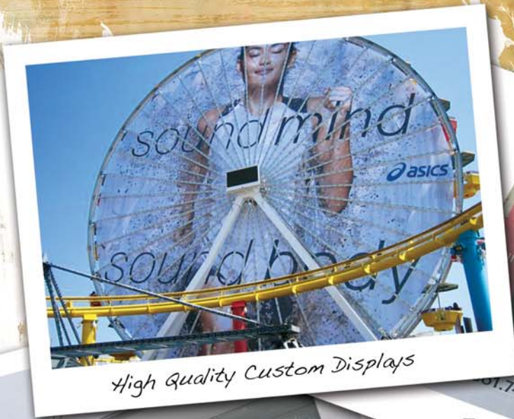
High Quality Custom Displays