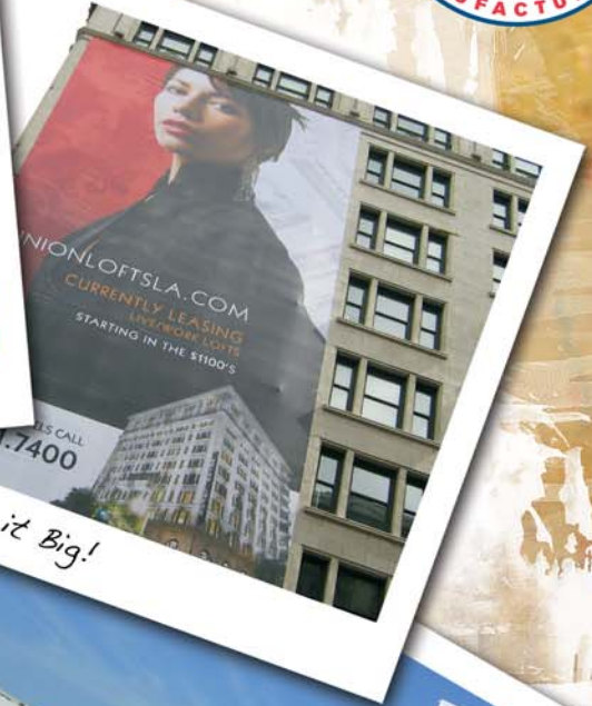
Say it Big!