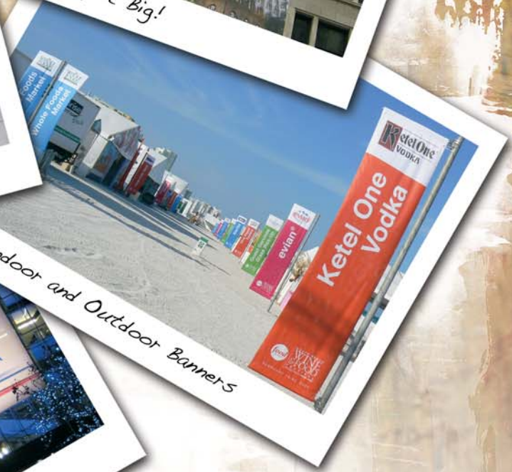
Indoor and Outdoor Banners