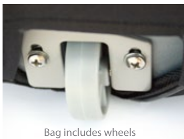
Bag includes wheels