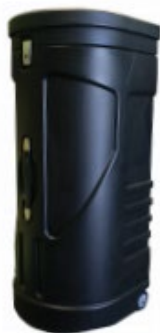
Half Hard Case is optional.