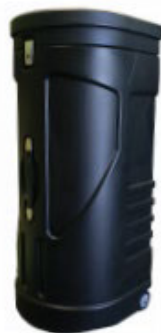
Half Hard Case is optional.