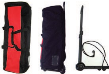
*Package includes padded nylon travel bag