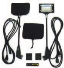
*Optional 200 watt halogen lights